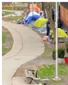
George Hislop park west side