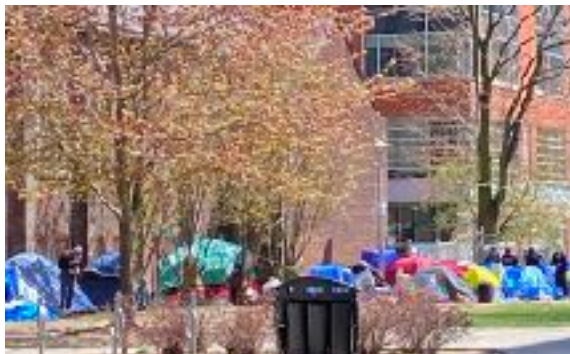
Sanctuary / George Hislop encampment east side of park

They call them "Covidiots", people who are not physical distancing, our "new normal"...The City of Toronto announces regularly on their "important work across the city" — Media release dated May 13, 2020 stated "Yesterday, the City received 65 complaints involving people using outdoor amenities or not practising physical distancing in parks or squares. Police issued four tickets – bringing the total number of tickets issued since May 1 to 59 tickets."