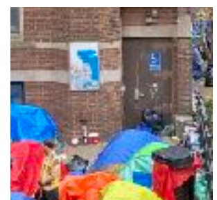
Sanctuary front yard